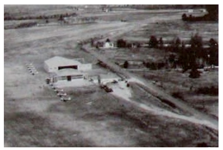
39 AAF College Training Detachment (Aircrew) airfield