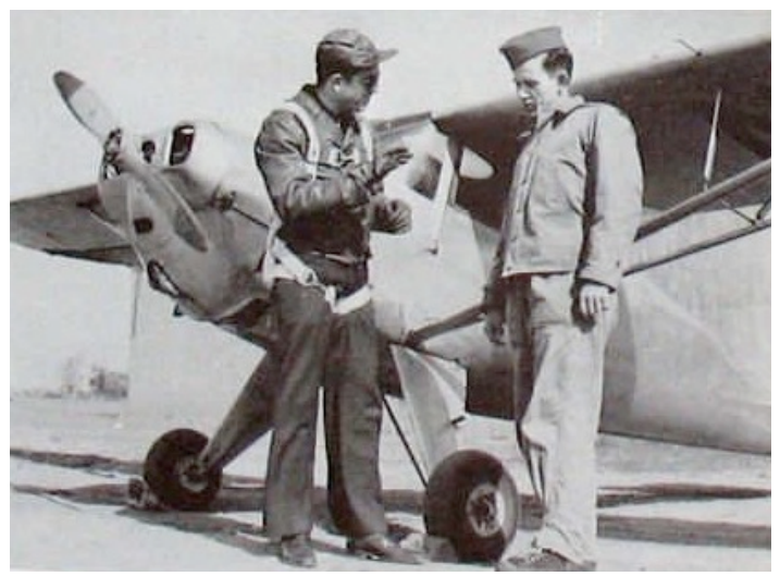
39 AAF College Training Detachment (Aircrew) instructor pilot with student.