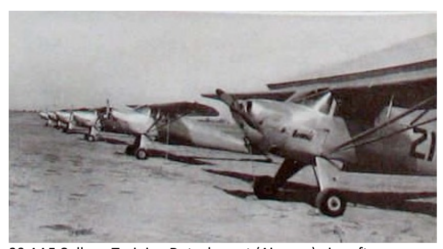
39 AAF College Training Detachment (Aircrew) aircraft